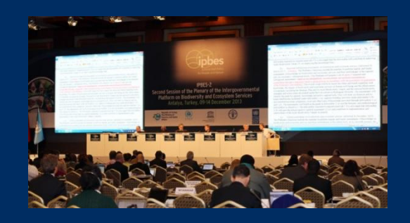
IPBES-2 (Dec 2013, Antalya)