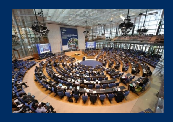
IPBES-1 (Jan 2013, Bonn)